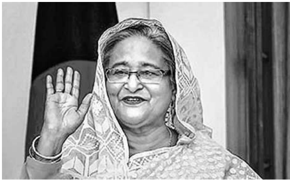
Sheikh Hasina’s Awami League has won 223 seats in the 300-member Parliament

The US State Department, in a press statement Monday, said that Washington remains concerned by the arrests of thousands of political opposition members and by reports of irregularities on election day in Bangladesh.